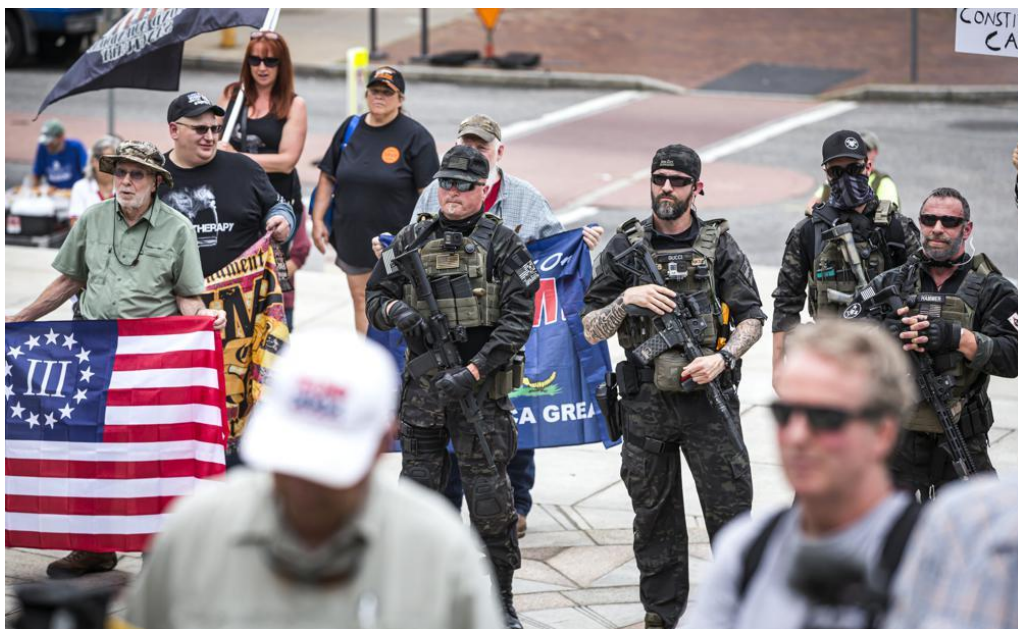
[WTMJ, 6/7/21 ]

The Iron City Citizen Response Unit's Logo Features A Symbol Known As The "Valknut."