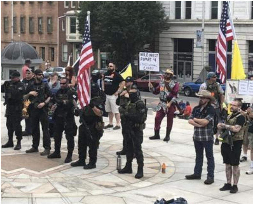
[The Daily Item, 06/07/21 ]

Militia-Dressed Individuals Had A Prominent Presence At The Rally: