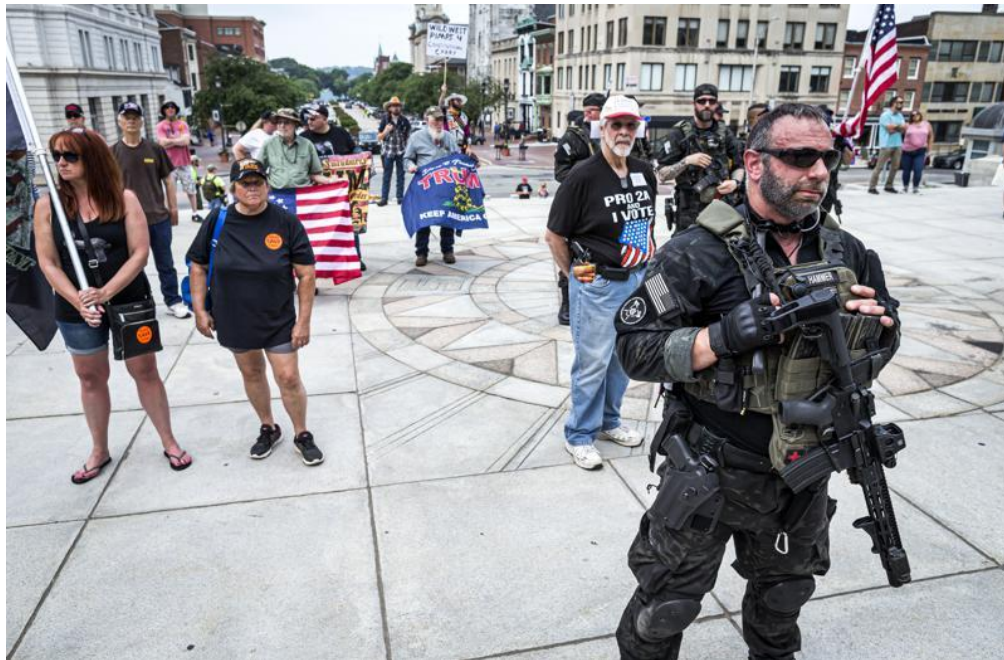
[Associated Press, 06/07/21 ]